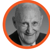
Dr. Burton Malkiel